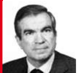
Luís Mira Amaral

E-mail: bancobpi@mail.bancobpi.pt • Website: www.bancobpi.pt