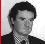
Member of the Board

E-Mail: osantos@isq.pt • Website: www.isq.pt