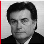
Member of the Executive Committee CEO